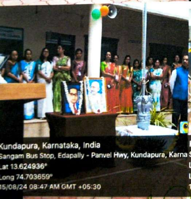
Kundapura, Karnataka, India Sangam Bus Stop, Edapally - Panvel Hwy, Kundapura, Karna Lat 13.624936° Long 74.703659° 15/08/24 08:47 AM GMT +05:30