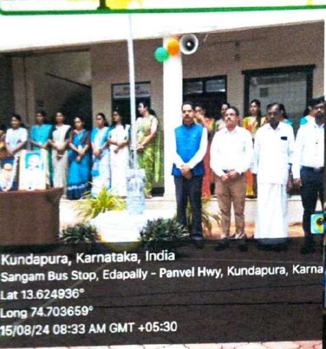
Kundapura, Karnataka, India Sangam Bus Stop, Edapally - Panvel Hwy, Kundapura, Karna Lat 13.624936° Long 74.703659° 15/08/24 08:33 AM GMT +05:30